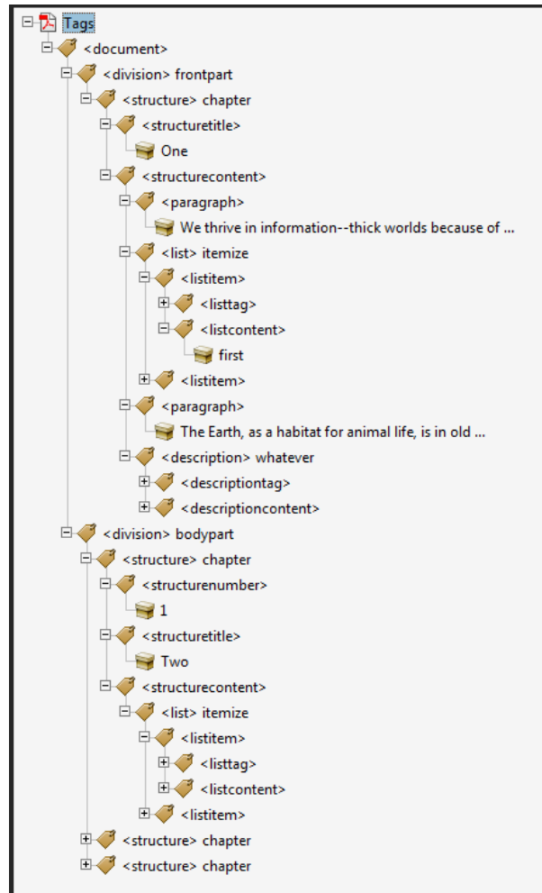
Figure 1: A tag list in Acrobat.