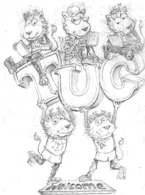
Figure 3: 2015 main prize: Duane Bibby's drawing.