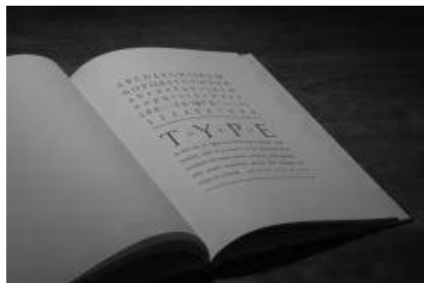
Figure 4: 2016 main prize: Manuale Zapficum .