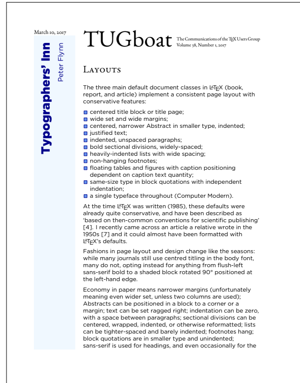
Figure 2: Re-envisioning some of L A T E X’s defaults

Fashions in page layout and design change like the seasons: while many journals do still use centered titling in the body font, many do not, opting instead for anything from flush-left sans-serif bold to a shaded block rotated 90° positioned at the left-hand edge (as in Figure 2).