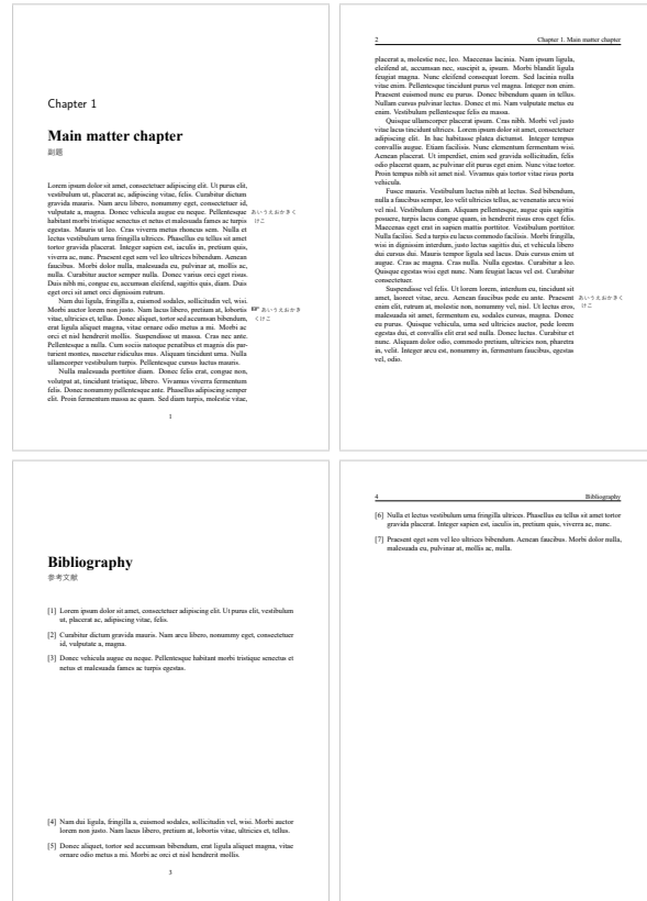
Figure 2: Ruled header including the margin, chapter marks and chapter page customisation (e.g., subtitle).

Finally, because automatically generated chapters like the table of contents do not call our command \newchapter to create the chapter, the subtitle given to the chapter title in the minor language and the extra mark for the header text need to be