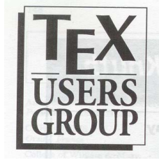
Figure 2: This is the TUG logo.